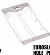
EUROSLOT/ HOLE PUNCH